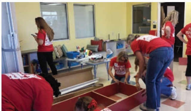
Thanks to our loyal volunteers we have already begun upgrade projects such as this new library installed in fall 2014

OSS is the site of our original housing program, and has served our community well but is now tired and dated in appearance and function and in much need of renovation. In order to accommodate the need for an expected increase in families transitioning to OSS, plans are now in place to convert existing space into a much needed additional five bedrooms. The renovation project is divided into two phases. Phase I includes painting, and the new flooring and plumbing needed to provide residents a warm, inviting and nurturing home to live in while practicing the skills needed to move themselves, and their families, towards independence.